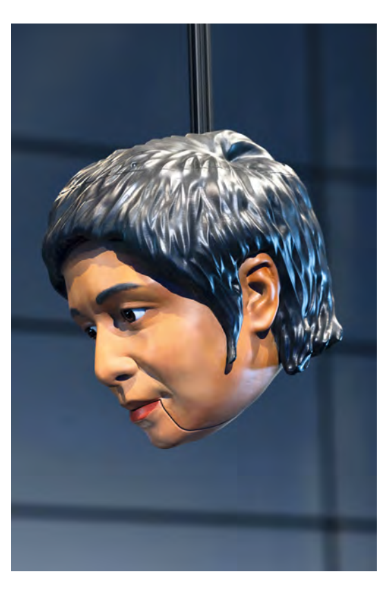
Suspended Delirium, 2021 (detail)