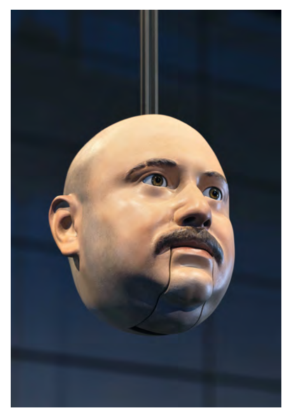
Suspended Delirium, 2021 (detail)

It's 2020. Or maybe it's 2021. Winter has taken over once again. Days have merged into an amorphous blob. Nobody remembers anything new happening to them anymore. Possibly that's why it's called "memory palace" - once you get stuck in it and can't leave, memory starts to play tricks on you. Making space for monsters.