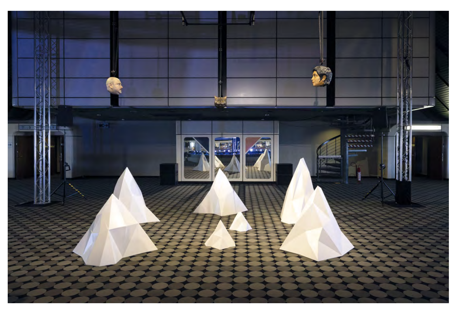
Suspended Delirium, 2021, robotic performance, 30 min., dimensions variable Installation view, "The Sun Machine Is Coming Down", International Congress Centre (ICC), Berlin

The three robotic heads, pierced by mechanical were still, appreciating the details of the texture arms, hang from the ceiling and hover above a and colour of the sculptures' skin, skillfully group of wooden polygonal plinths that remind of painted by Said Baalbaki. The music starts and the mountains on the cover of Radiohead's Kid A they came to life. Sitting on the carpeted floor, (2000). The mise-en-scène is bare, rhyming with the captivated by their voices and the dramatic tenbuilding's aesthetic style that reveals the function sion built by the soundtrack of synthesised mawof its parts; the feeling of uncanniness comes from wals, the surroundings magically fade out. facing an outdated version of the future, retrieved The chord progression doesn't "land" or find resfrom the archive of contemporary culture. olution - it's a song that builds its stage, like pho-Viewers gather around slowly, observing tographic paper slowly developing in front of the piece from all angles while the characters your eyes. The influence of Eugène Ionesco and